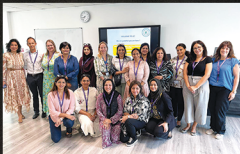
JC SAFEGUARDING COURSE FOR THE PTA NOV 16 2023