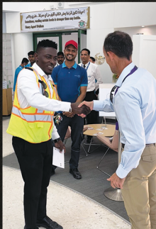
GIFTING TO SUPPORT STAFF FOR THEIR HELP IN SPRING FIR