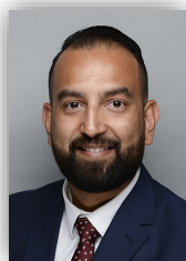
Mr Tank Mathematics